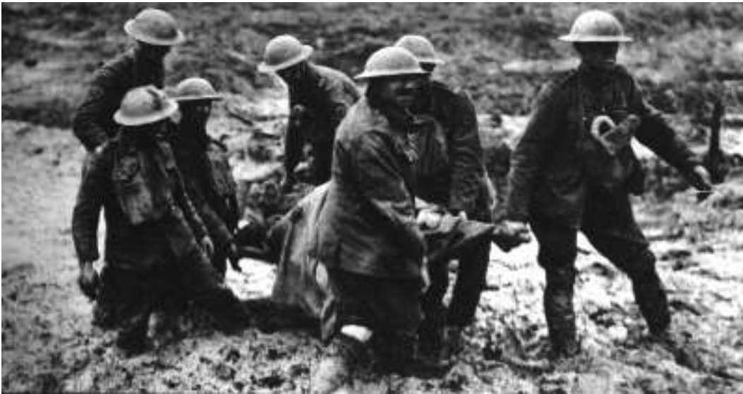
This famous photograph was taken near Pilkem Ridge (see map above)